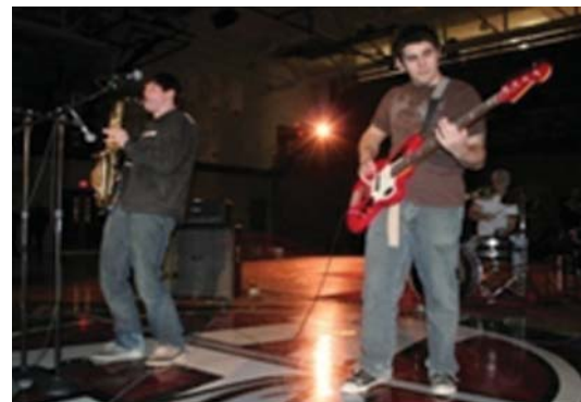
Dress Code Infraction won the Battle of the Bands