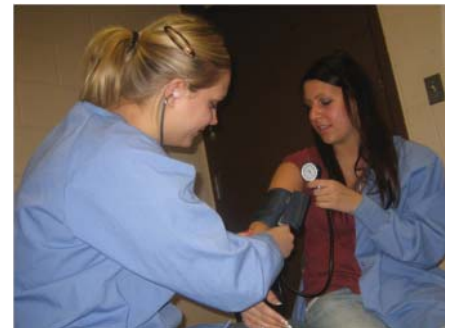
Lakes' Technical Campus students practice performing nursing assistant skills

• As evidence of our effort to increase academic rigor, we have more than a 40% improvement in students taking Advanced Placement exams and the number of total exams scheduled to be taken have increased by 45%. Our students continue to push themselves toward higher achievement!