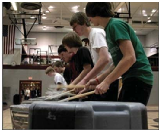
The drum line thrills the crowd with their 'garbage can' show