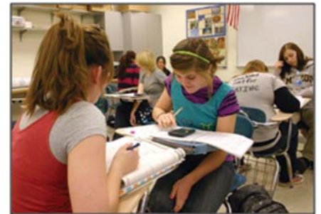
Math students work in groups on Pi Day