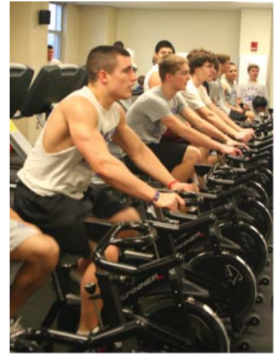
Boys Track Team prepares for the spring season

•Our spring teams are off to a strong start! Come support our teams as they compete for a strong finish.