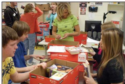
Students collect books for our Reach Out and Read program

●Book Clubs continue to thrive at ACHS with twenty seven staff members reading and discussing The Book Thief . Many students read and collectively examined the best seller Twilight . Stay tuned for our next community book choice.