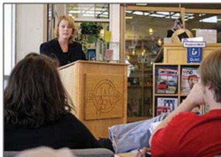
Congresswoman Melissa Bean shares some insights with our government classes

•All honors math students took part in American Mathematics Competition this past February. In the past only a select group had participated in the exam. Our Math and Science Departments have been working together to better align our Algebra I and Physics First curriculum. Their efforts led to the fewest failures by freshmen in these departments.