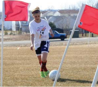
Girls Eagle Soccer Team practice their skills