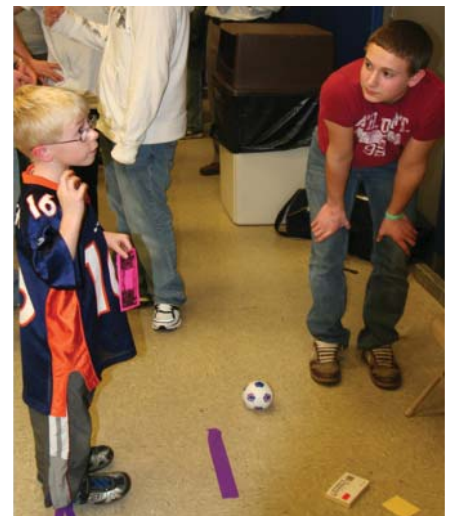
More than 230 elementary students took part in our Math Fair this year which is far greater than previous years