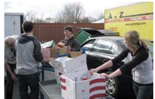
Student Council members load food donations

•Please consider supporting Lakes Community High School by joining us on Saturday, April 25th at the Antioch Golf Club for our Third Annual Lakes Eagles Booster Bash. All proceeds go back to enriching the programs and experiences of our students.